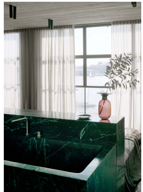
Text by Carli Phillips. Styling by Atelier Lab. Photographs by Gavin Green.

This Sydney home by Studio Prineas honours the past and the present, descending from a moody stairwell finished with walnut veneer past glimpses of harbour views. At its base, the open-plan room balloons open with pared-back neutrals, full light and blackened steel beams. The application of materials is used to create the sensation of greater space. Leather-clad sliding walls expand and contract, mirrored surfaces create an illusion of depth – and in this main bedroom, a solid-stone bath doubles as a bedhead to free up space. Joinery cuts clutter in it and the home's other bedrooms. For Where to Buy, see page 217. H&G