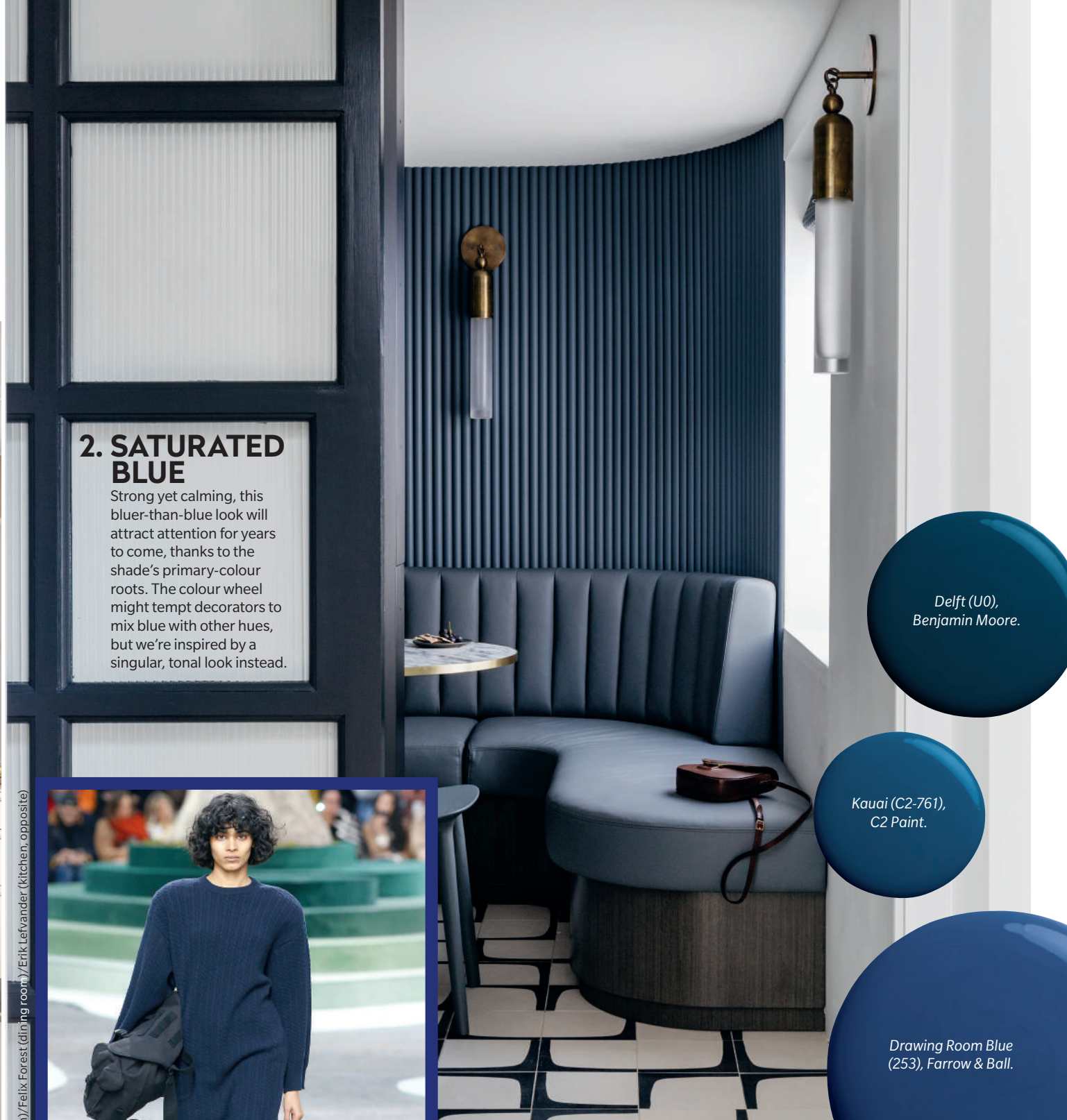
Delft (U0), Benjamin Moore.

Strong yet calming, this bluer-than-blue look will attract attention for years to come, thanks to the shade's primary-colour roots. The colour wheel might tempt decorators to mix blue with other hues, but we're inspired by a singular, tonal look instead.