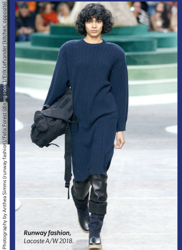
Runway fashion, Lacoste A/W 2018.

HOW TO MAKE IT WORK: Beige is anything but boring when it leans toward buff hues. Create a nude kitchen that feels just as timeless as the all-white version, but with an extra dose of dimension, by choosing buff tones for your cabinetry, walls and drapery. Black accents strengthen the look. Room design, Liljencrantz Design.