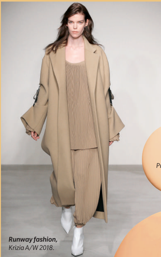
Runway fashion, Krizia A/W 2018.

It's been nearly three years since Pantone declared Rose Quartz one of its Colours of the Year, yet the popularity of pale — or “millennial” — pink hasn't waned. We're loving the new peachy nude rendition of the trend; the softness of the shade flatters in fashion and home furnishings.